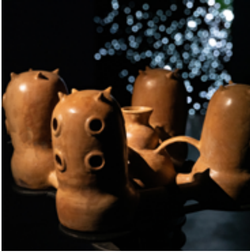
Elegías a un paisaje , 2023.

Five-body vase whistle with four aerophonic systems and acoustic chambers made in Argentina, 40 x 30 x 40 cm