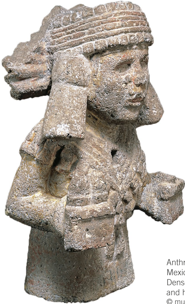
Anthropomorphic sculpture of a goddess, Mexico, Aztec culture, 1350-1521 Dense greyish volcanic rock, goethite ochre and hematite red pigments