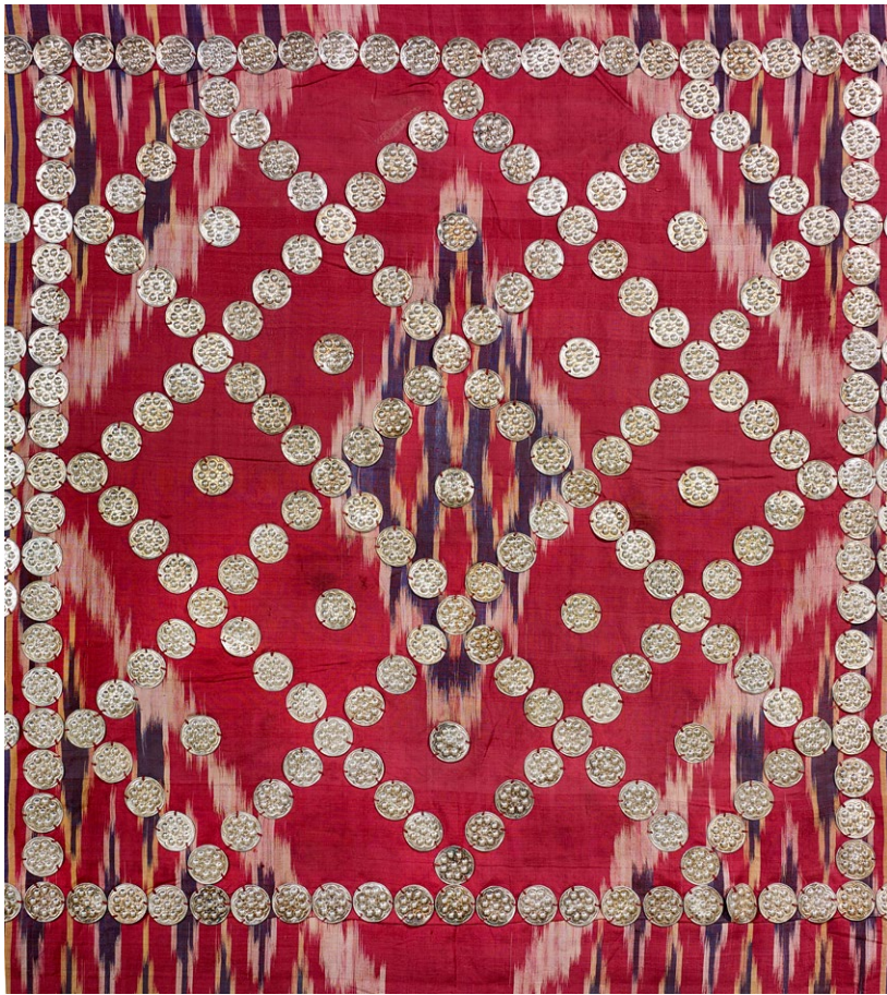
Bath sheet, Baghdad, Iraq Early 20th century Ikate silk, silver (detail)