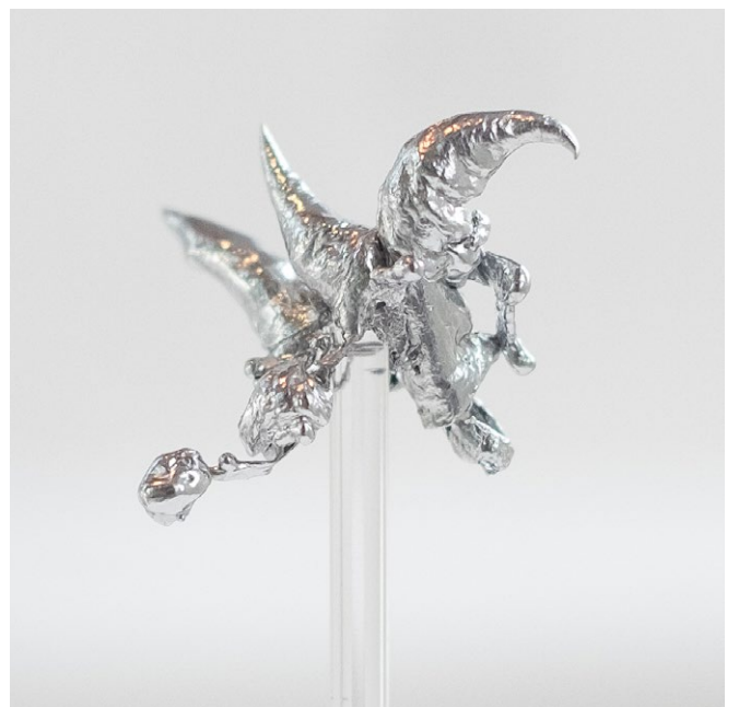
Benoît Pype, Chutes libres (Free falls), 2015 Installation, tin, 2 x 2 x 1 cm