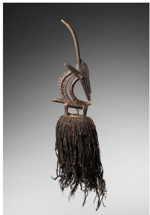
Crest mask, Ciwara, Mali Population Bamana, before 1931 Mud-dyed wood and plant fibres