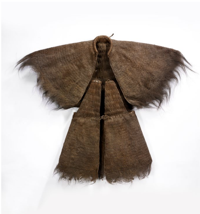
Rain cape, Philippines, late 19th century Topstitched infrapetiolar palm fabric