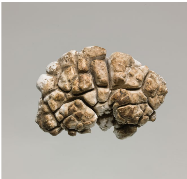
Magic Stone, New Caledonia, Kanak population Mid 19 th - early 20 th century Lithic, concretion of magnesia