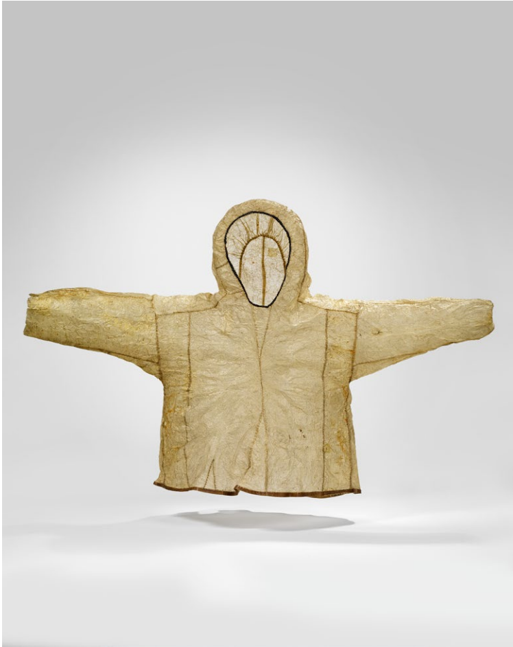
Child's anorak, Alaska, America Yupik / Inuit culture, late 19 th century Seal intestine, leather