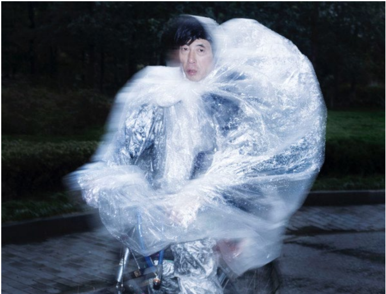
Wiktoria Wojciechowska, Short Flashes (detail), 2013 Photograph, 80 x 768 cm