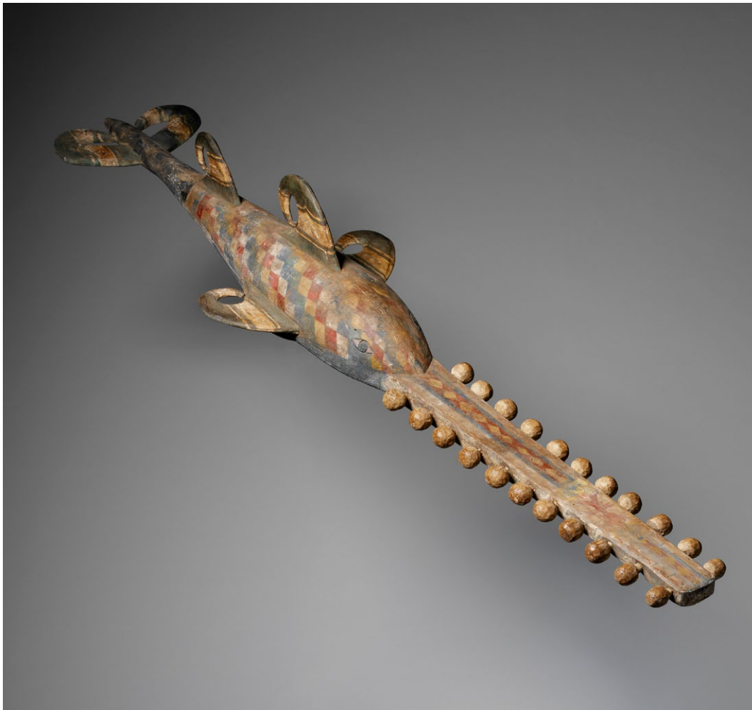
Crest mask sawfish, Nigeria, Ijo population, 20 th century Wood, pigments including kaolin and ochre